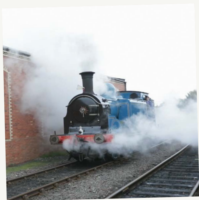
Bo'ness & Kinneil Railway