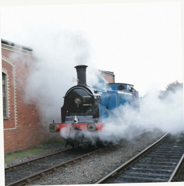
Bo'ness & Kinneil Railway